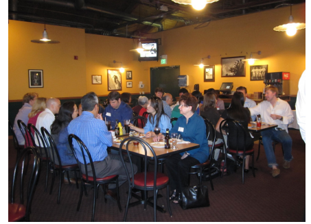
Everyone at Breckenridge Brewery

We had representatives from a variety of business, including American Zephyr, Leprino Foods, M.E.M. Travel, Polsinelli Shughart and more! In addition, we had a mix of Japanese and non-Japanese, members and friends.